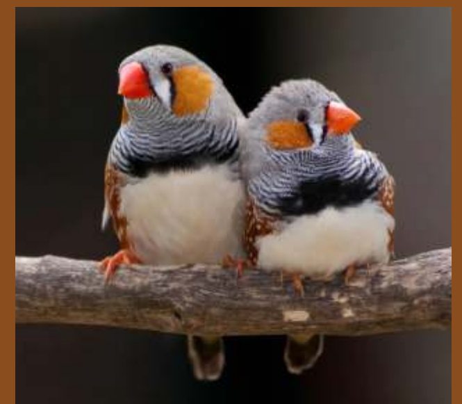
Zebra Finches ( Taeniopygia guttata ) received from Sayaji Baug Zoo, Vadodara, Gujarat