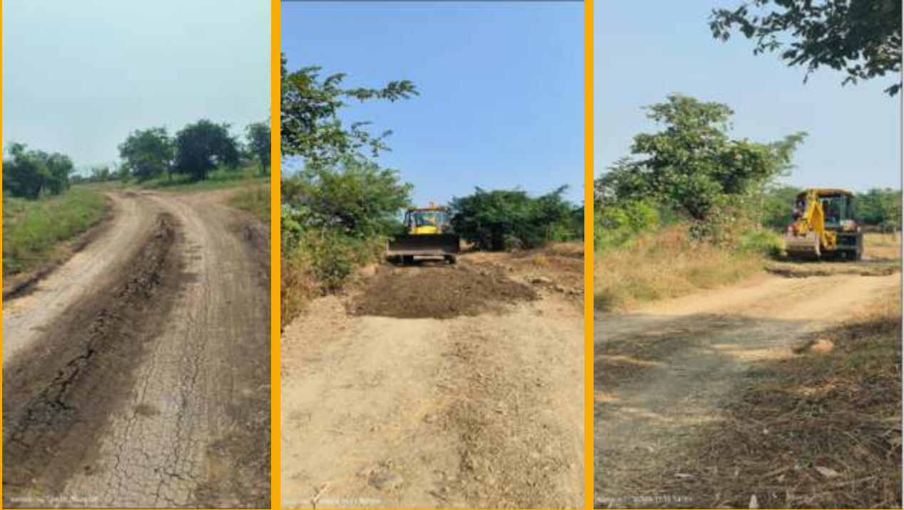
Road Repair and Maintenance in Gorewada Reserve Forest before opening it to visitors after Monsoon.