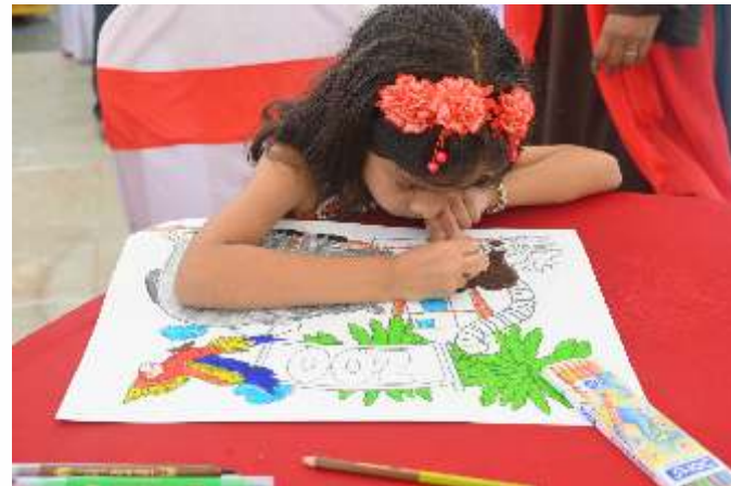
Glimpses of drawing competition