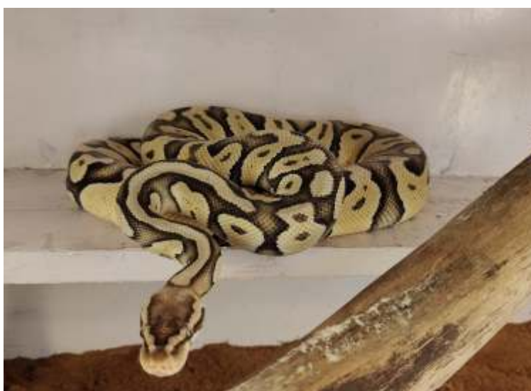
Ball Python ( Python regius )