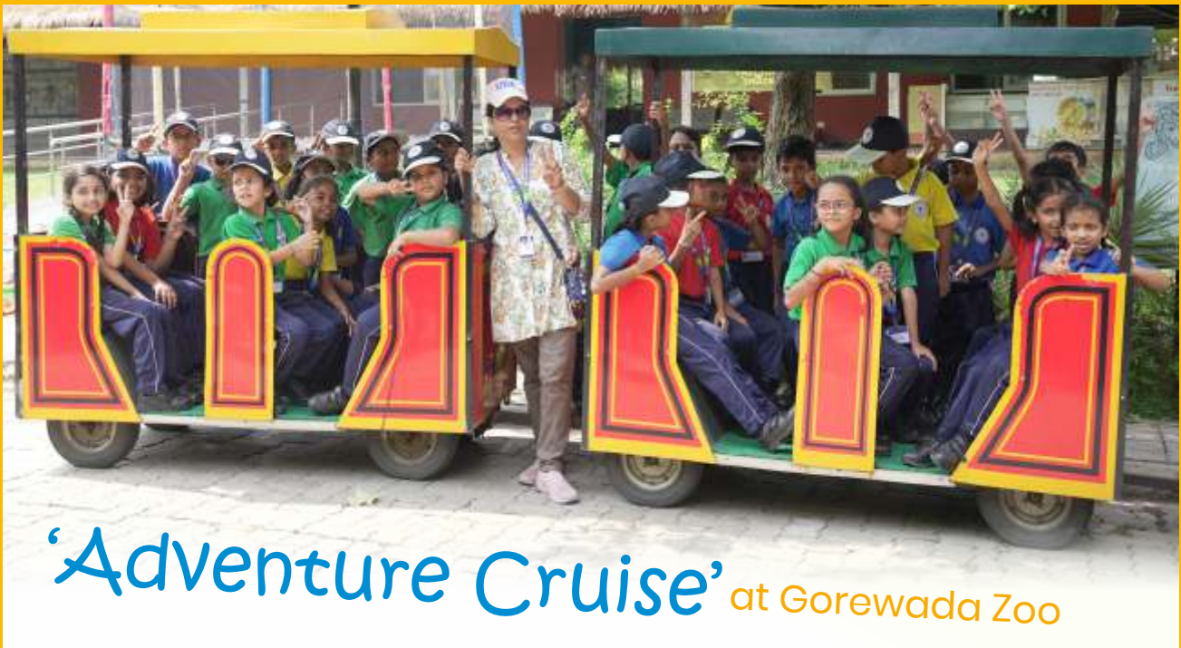
'Adventure Cruise' at Gorewada Zoo

• Kiddos Adventure Cruise : On October 3 rd , Gorewada Zoo hosted the Kiddos Adventure Cruise Program, an exciting event tailored for children aged 5-7 years. With the support of the Maharashtra State Zoo Authority, the activity provided a fun-filled and educational experience, fostering a sense of adventure and curiosity about nature. A total of 40 young participants eagerly joined the program, making it a memorable day for the budding explorers.