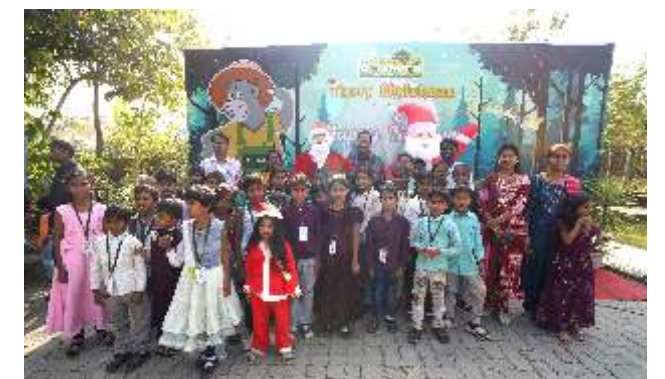
Glimpses of our Christmas celebration at Gorewada Zoo