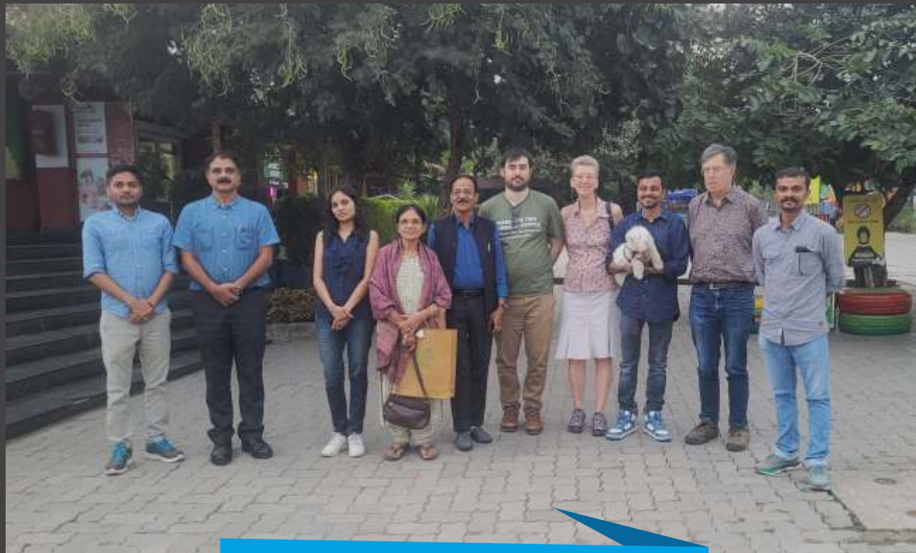
Ex. Minister Shri. Rajkumar Badole and others