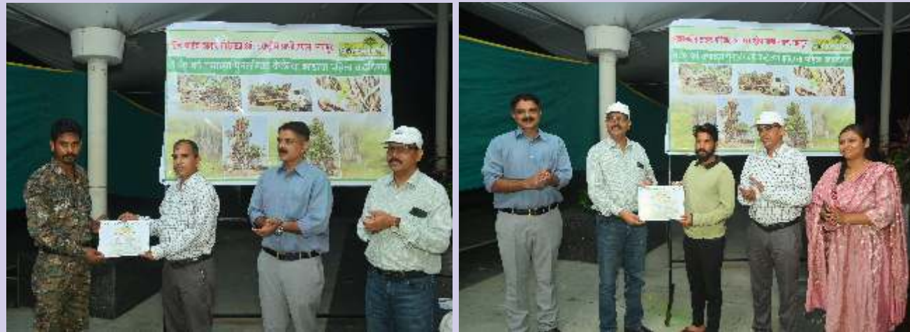
Zoo Keepers who were immensely involved in the process of trans-plantation were felicitated by Zoo Director and other officials