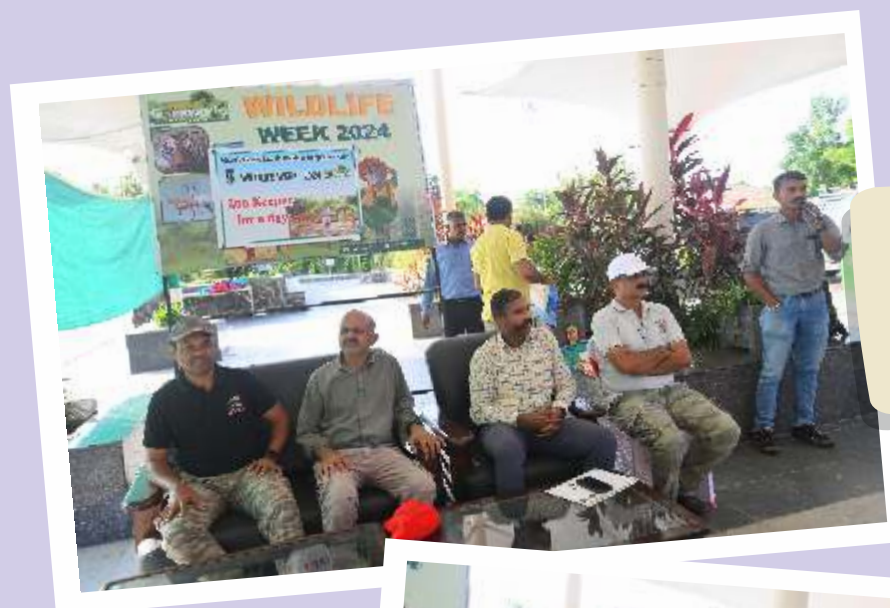
Officials present during Prize distribution