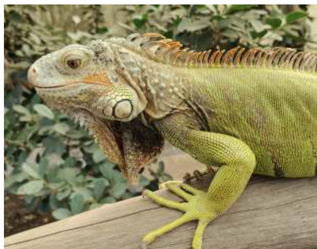
Green Iguana ( Iguana iguana )