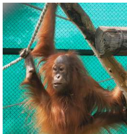
Rescued Orangutan ( Pongo pygmaeus ) in the care of zoo