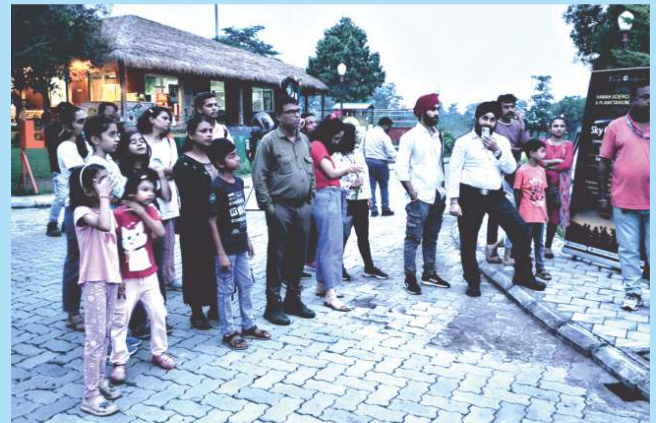
Participants of Astro Night