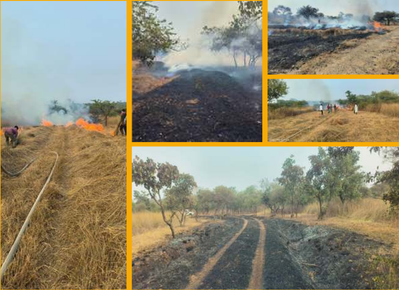
Fire line cutting and burning operation