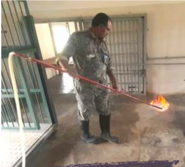
Flaming – a Bio-security measure for indoor housing of animals

As a part of dietary enrichment, empty Coconut shells filled with honey and insect based diet for enrichment of Sloth Bear in Kraal.