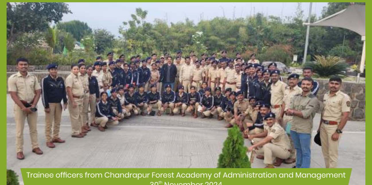
Trainee officers from Chandrapur Forest Academy of Administration and Management 30 th November 2024