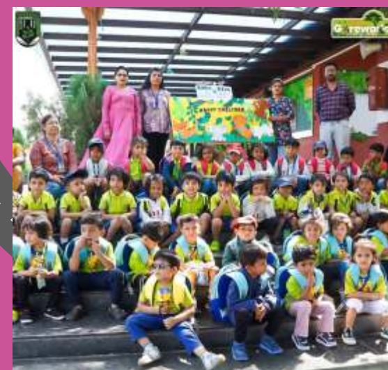
Students during their visit at Gorewada Zoo