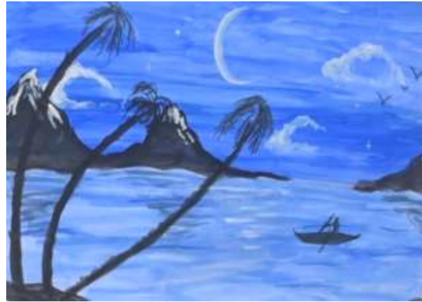
Drawing competition on occasion of Wildlife week