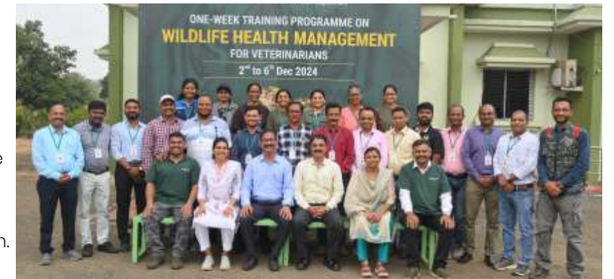
One-week training programme on 'Wildlife Health Management' for Veterinarians on 2 nd to 6 th December at Gorewada Rescue Center .