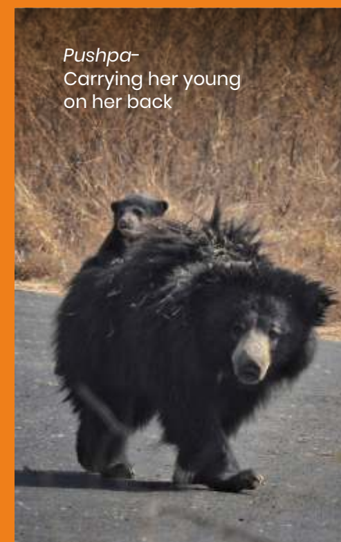
Pushpa- Carrying her young on her back