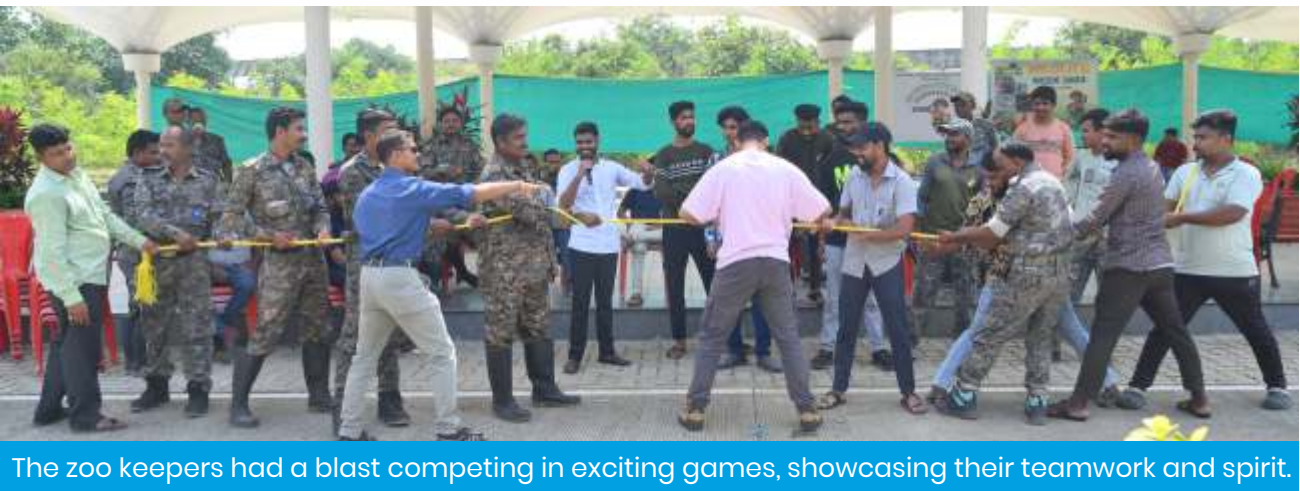
The zoo keepers had a blast competing in exciting games, showcasing their teamwork and spirit.