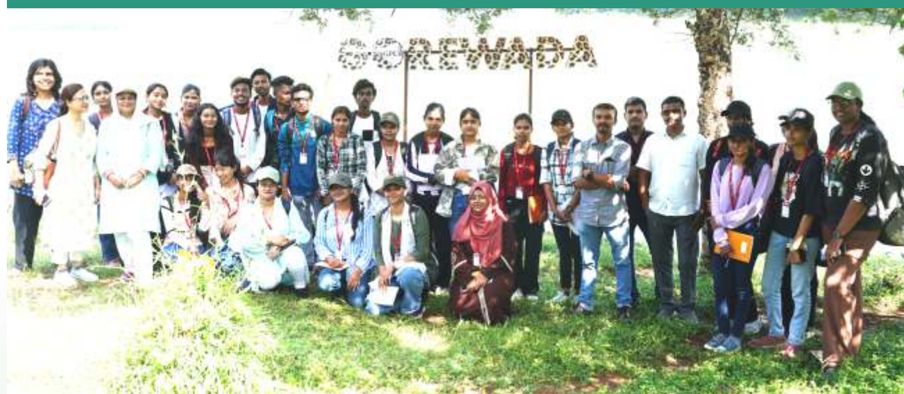
Students of Hislop college during their visit at Gorewada Bio-park