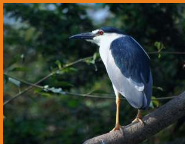
Comb Duck ( Sarkidiornis sylvicola ) & Night Herons ( Nycticorax nycticorax ) are received from Sayaji Baug Zoo, Vadodara, Gujarat