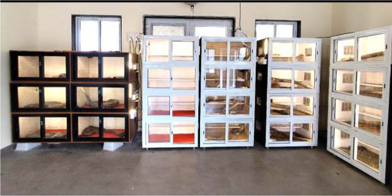
Off-exhibit Reptile holding facility for housing rescued snakes.