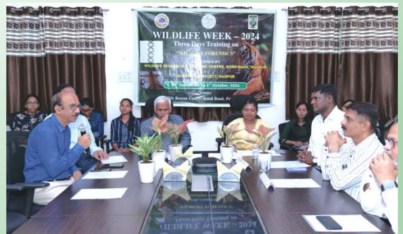
Dignitaries during inaugural session