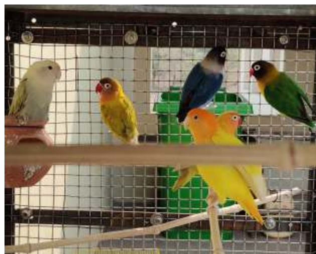
Rosy-faced Lovebird ( Agapornis roseicollis ) received from Sayaji Baug Zoo, Vadodara, Gujarat