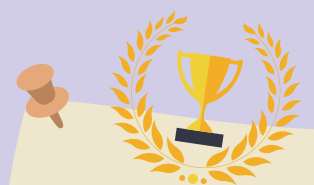
Felicitation of winner of Drawing competition