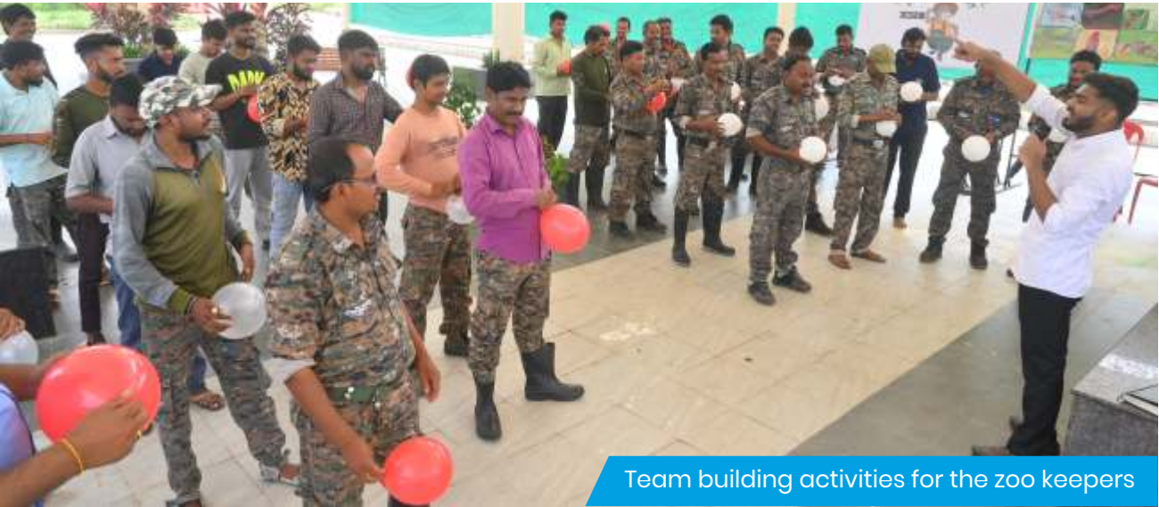
Team building activities for the zoo keepers

• Yoga Session and Keeper Day : On October 4 th , a rejuvenating yoga session for zoo staff promoted health awareness. The same day, Zoo Keeper Day featured games and team bonding activities for keepers. All the zoo keepers enthusiastically participated in the events, embracing the benefits of yoga for a healthy lifestyle.