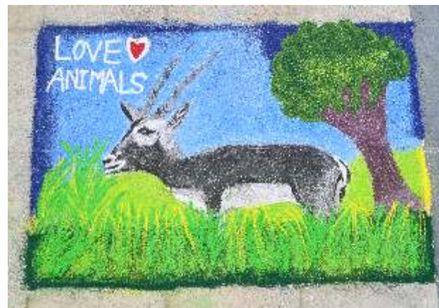
In the rangoli competition, participant creatively depicted the wildlife.