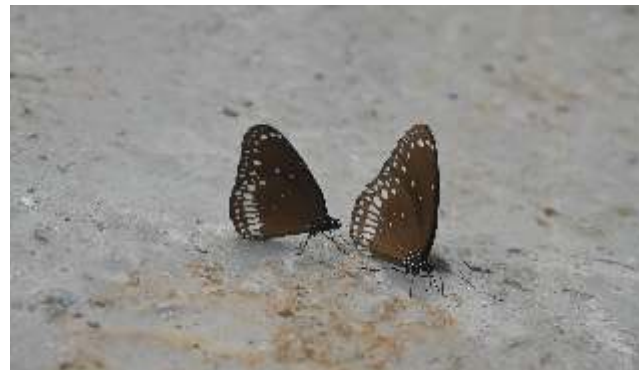
Pupal and adult stages of Common crow ( Euploea core ) were observed during this activity at Bio-park

Bird Watching : On October 7 th , a bird-watching event near Gorewada Lake recorded 17 bird species, with Biologist Mr. Darshan Dudhane sharing insights into their habitats and behaviours.