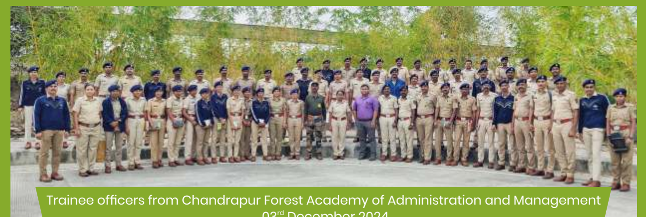
Trainee officers from Chandrapur Forest Academy of Administration and Management 03 rd December 2024