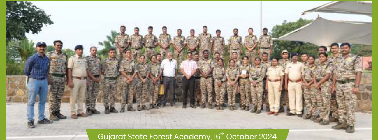
Gujarat State Forest Academy, 16 th October 2024