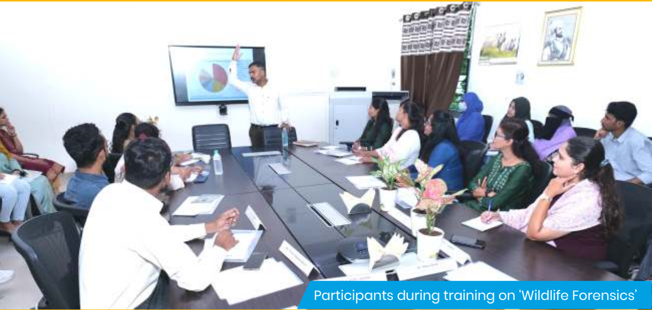
Participants during training on 'Wildlife Forensics'