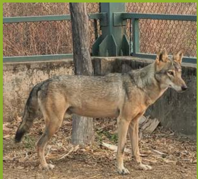
Indian Wolf ( Canis lupus )