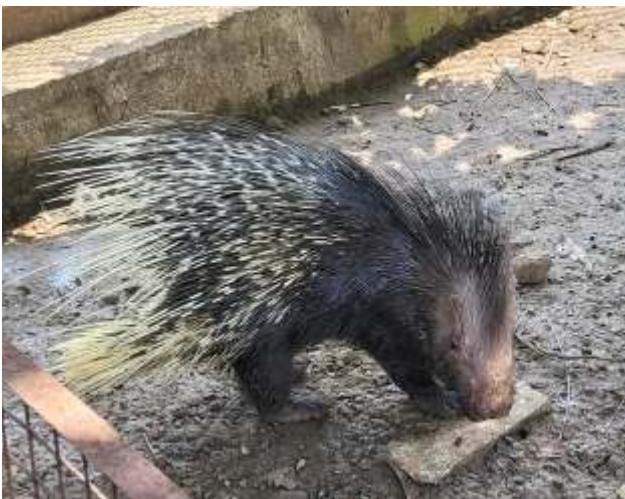
Indian Crested Porcupine ( Hystrix indica )