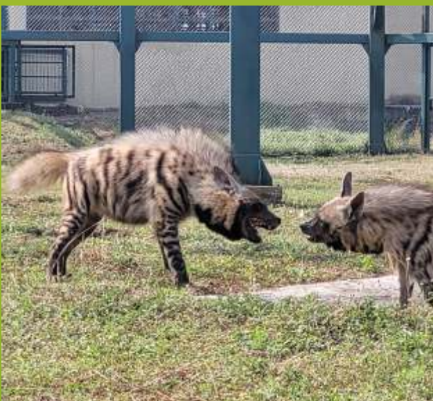
Striped Hyena ( Hyaena hyaena )