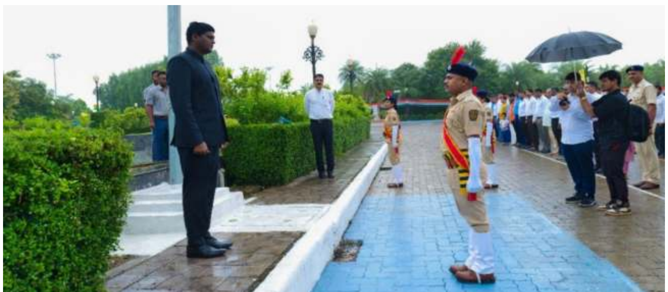
Flag Hoisting Ceremony