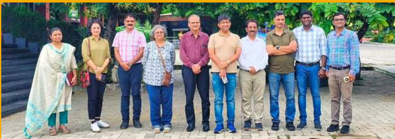
Delegates from Bombay Natural History Society (BNHS)