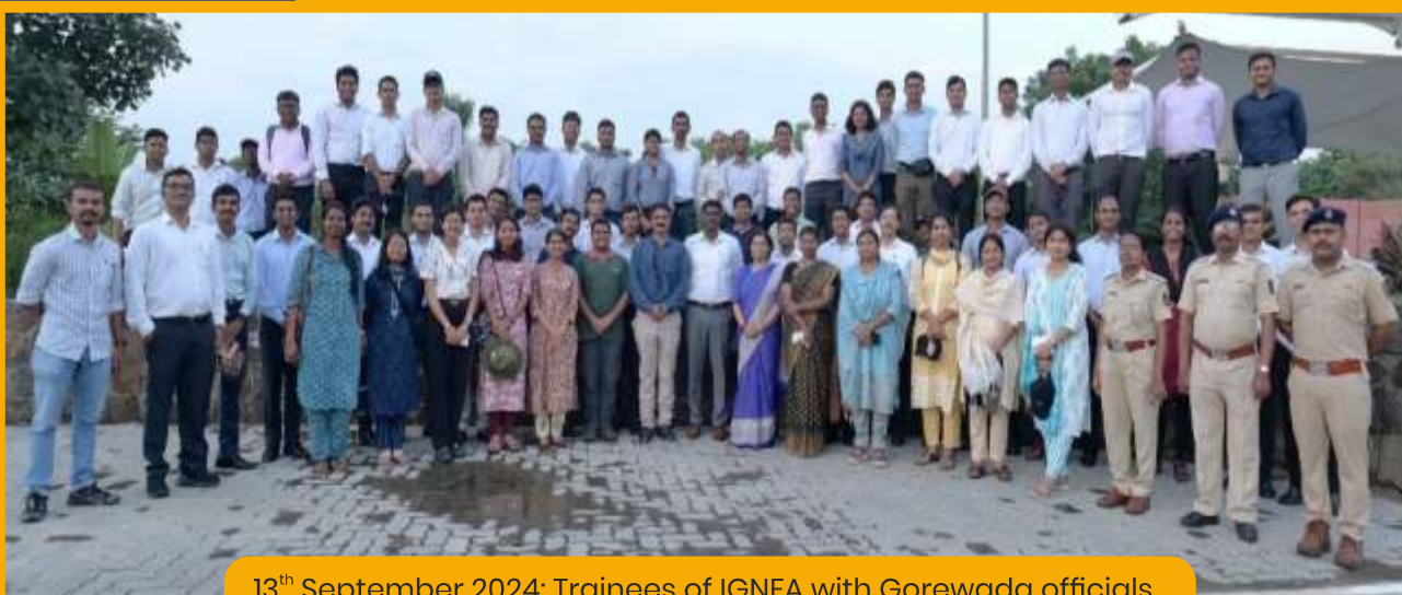
13 th September 2024: Trainees of IGNFA with Gorewada officials