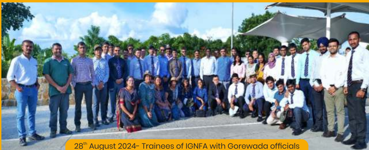
28 th August 2024- Trainees of IGNFA with Gorewada officials