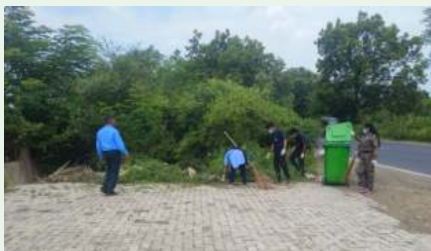
Plastic collection drive along highway passing through Gorewada Reserve Forest

Cleanliness Drive: Gorewada Zoo premises is a plastic free premise. Under the Swacchata Pakhwada - plastic collection drive was conducted along the highway passing through Gorewada Jungle.