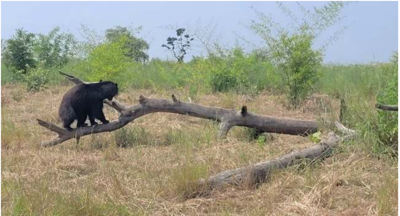
Sloth bear ( Melursus ursinus ) dietary enrichment with honey and insect-based food