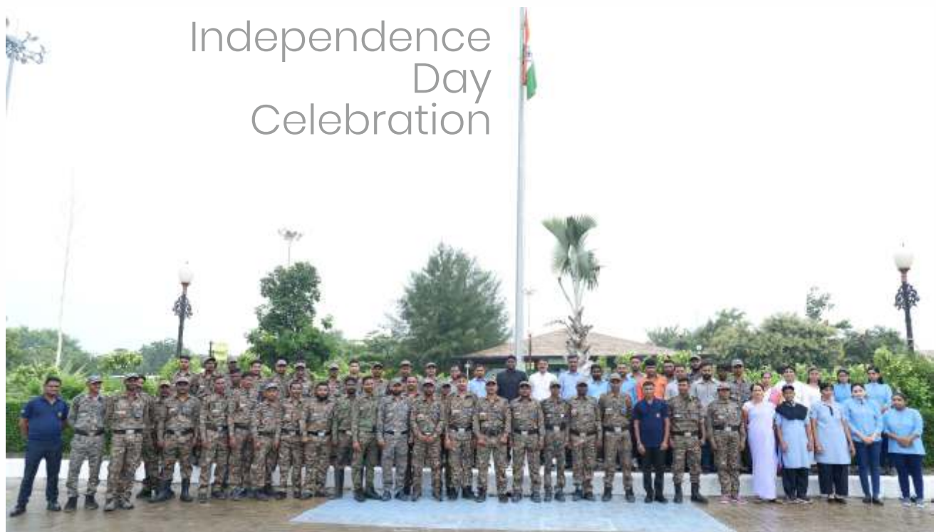
Staff members at Independence Day