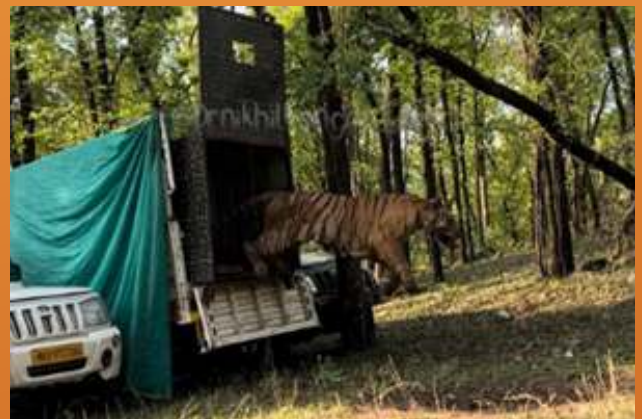
An injured Tiger (T-53) from Pench Tiger Reserve was Rescued, treated successfully and released back into the wild.