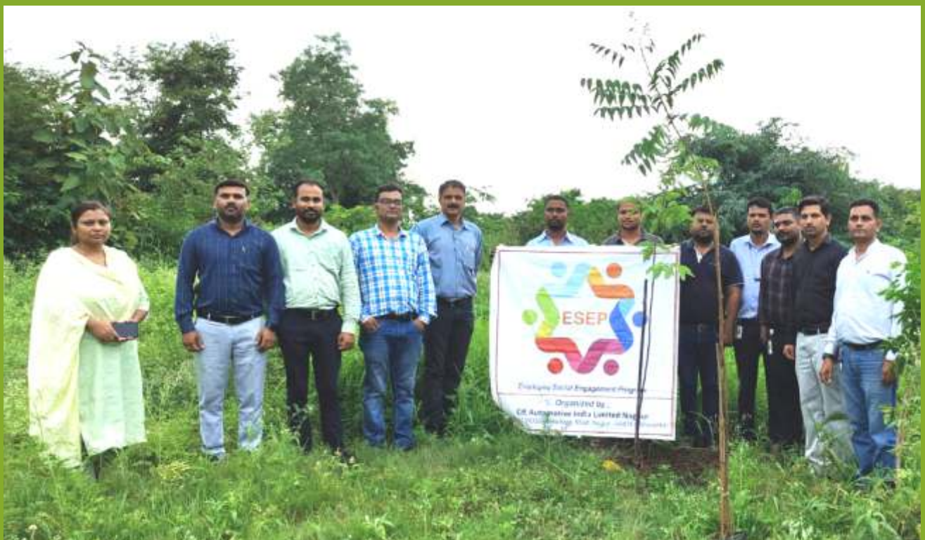
Officials of CIE India Automotives Pvt Ltd & Gorewada staff at the plantation program