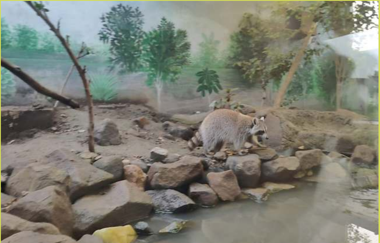
Raccoon ( Procyon lotor ) rescued from Mumbai Dock Yard is housed in Gorewada Zoo.

SPECIES CONSERVATION, REHABILITATION, & PUBLIC EDUCATION.