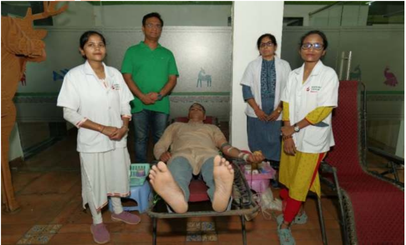
Representatives of Tirpude Blood Bank Trust, Nagpur at Blood Donation Camp

“Donate blood, save lives. Be a hero in someone's story today”