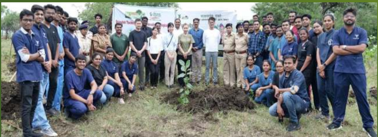
Delegates from Japan and Veterinary students at 'Ek-ped maa ke naam' the plantation drive at zoo

The event was honoured by the presence of the Deputy Director of the Tourism Directorate, along with special guests from Japan. A group of 40 veterinary interns from MAFSU also participated in the occasion.