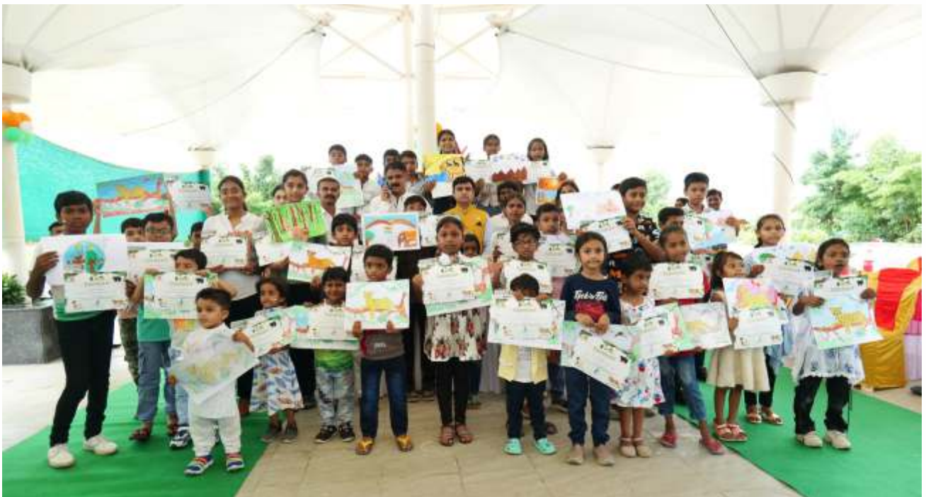
Participants of Drawing Competition