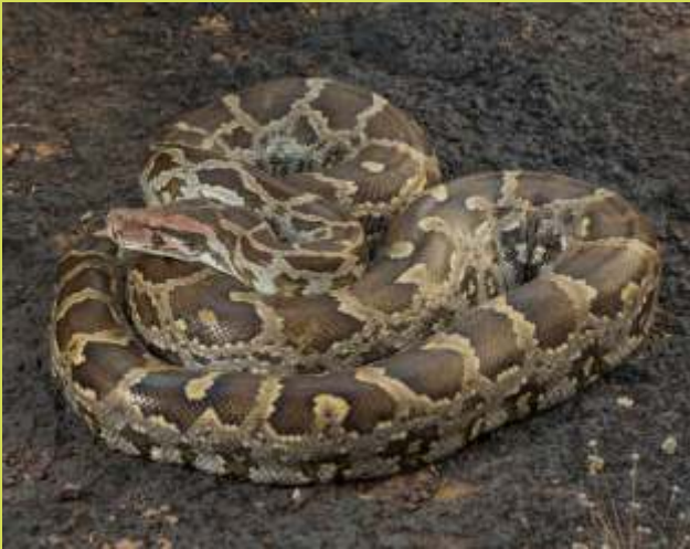
Indian Rock Python ( Python molurus )