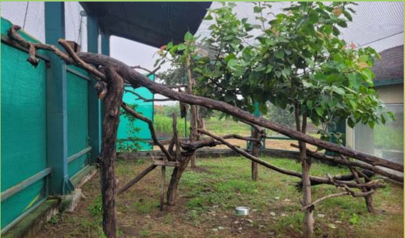
New enclosure set-up for Asian Palm Civet ( Paradoxurus hermaphroditus )