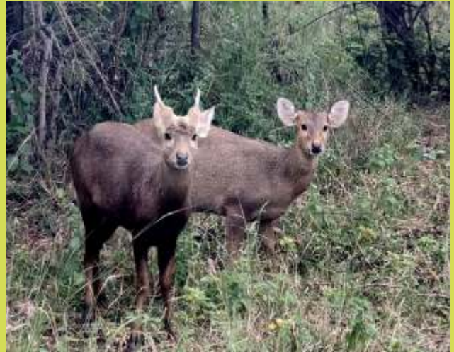
Hog Deer ( Axis porcinus )