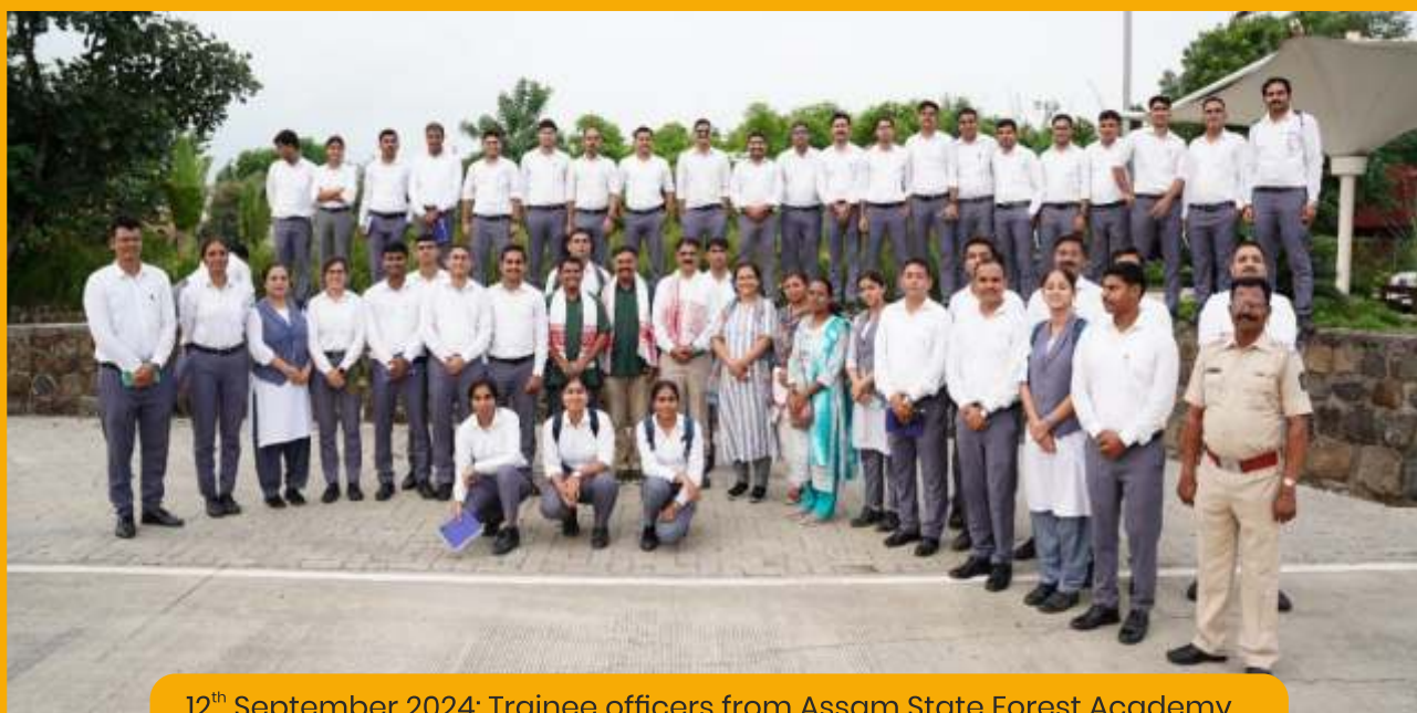
12 th September 2024: Trainee officers from Assam State Forest Academy