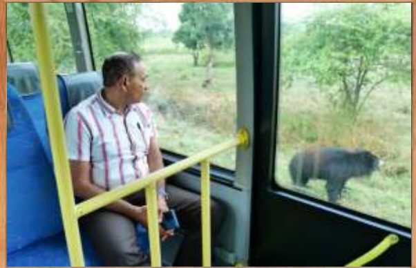
25 th September 2024: Shri. Vivek Khandekar, Chief Wildlife Warden, Maharashtra State