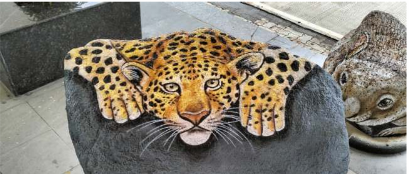
Stone arts with animal painting being displayed at the zoo