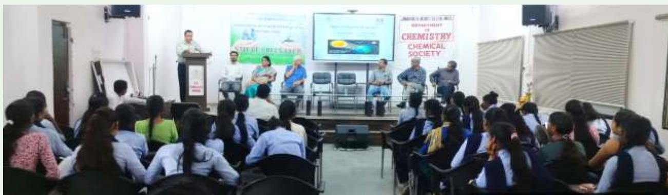
Workshop on World Ozone Day at Jawaharlal Nehru College, Wadi, Nagpur.

from Gorewada Zoo conducted event with insightful talks, thought-provoking discussions. Students were sensitised on Ozone depletion and relevant environmental issues.