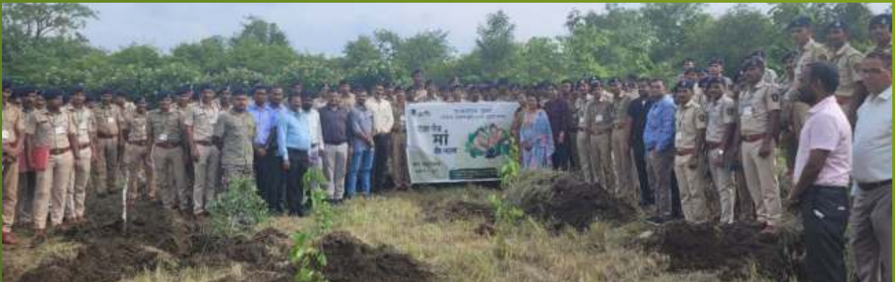
'Ek ped maa ke Naam' – the plantation drive at zoo