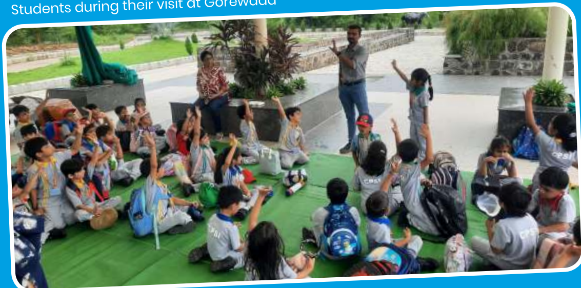
Students during their visit at Gorewada