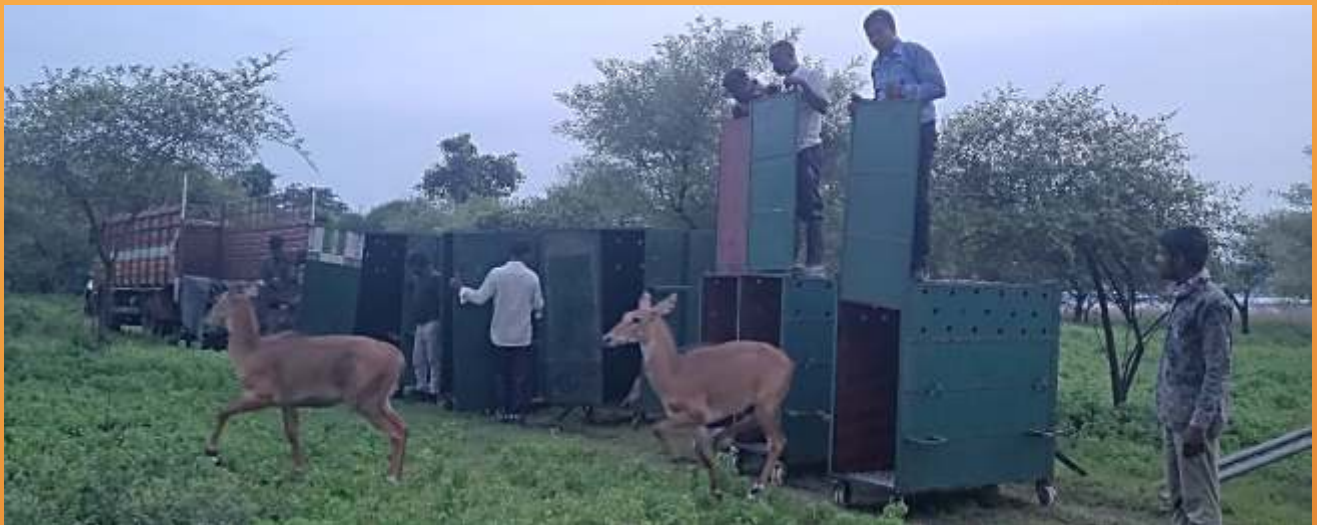
Rewilding of rescued Nilgai ( Boselaphus tragocamelus ) in Gorewada Reserve Forest

Rewilding rescued animals at Gorewada Zoo is a critical conservation initiative aimed at restoring wildlife to their natural habitats. This process involves rehabilitating animals that have been rescued from human-wildlife conflicts, injuries, or illegal trade. At Gorewada Zoo, specialized care is provided to ensure the physical and behavioural health of these animals, preparing them for eventual release into the wild.